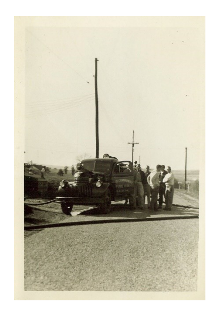
Bair Community Fire Co.

In this case, I think I may know where these came from, but I'm not 100% sure. These were all together, and I think they were from either a fire incident, or from a training evolution. I'm leaning towards a relay pumping exercise. Either way, they're a great look back at some classic fire apparatus!