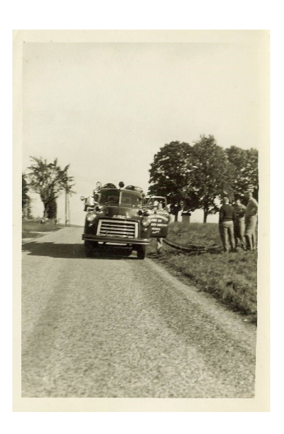
Porters Community Fire Co.