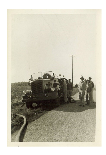
Seven Valleys Fire Co.