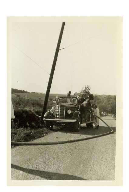
Jefferson Fire Co.