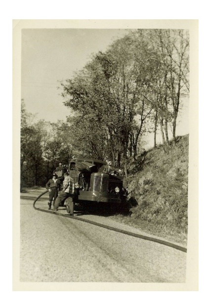
York New Salem Fire Co.